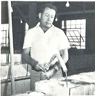
(1) Slip Casting