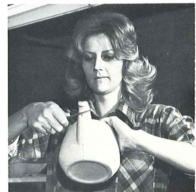
(4) Trimming with knife.