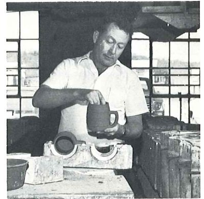
(2) Removing piece from mold.