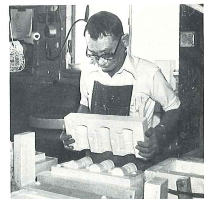
(8) Making a Mold