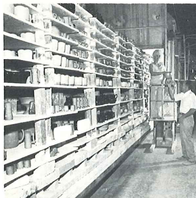
(7) Stacking kiln for firing.